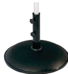
25KG Concrete Portable Base

Single plate (approx 30kgs) recommended for 2.0m sq/2.7m oct sizes. Double plate (approx 60kgs) recommended for 3.0m sq/4.0m oct sizes