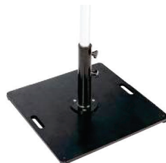
HD Commercial Black Galvanised Flat Plate Portable Base

Single plate (approx 30kgs) recommended for 2.0m sq/2.7m oct sizes. Double plate (approx 60kgs) recommended for 3.0m sq/4.0m oct sizes